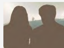
M & M* Sent 2012