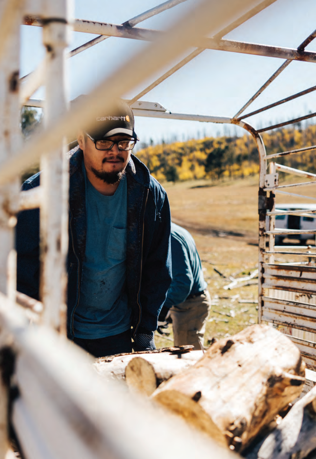
Firewood ministry in Gallup, New Mexico