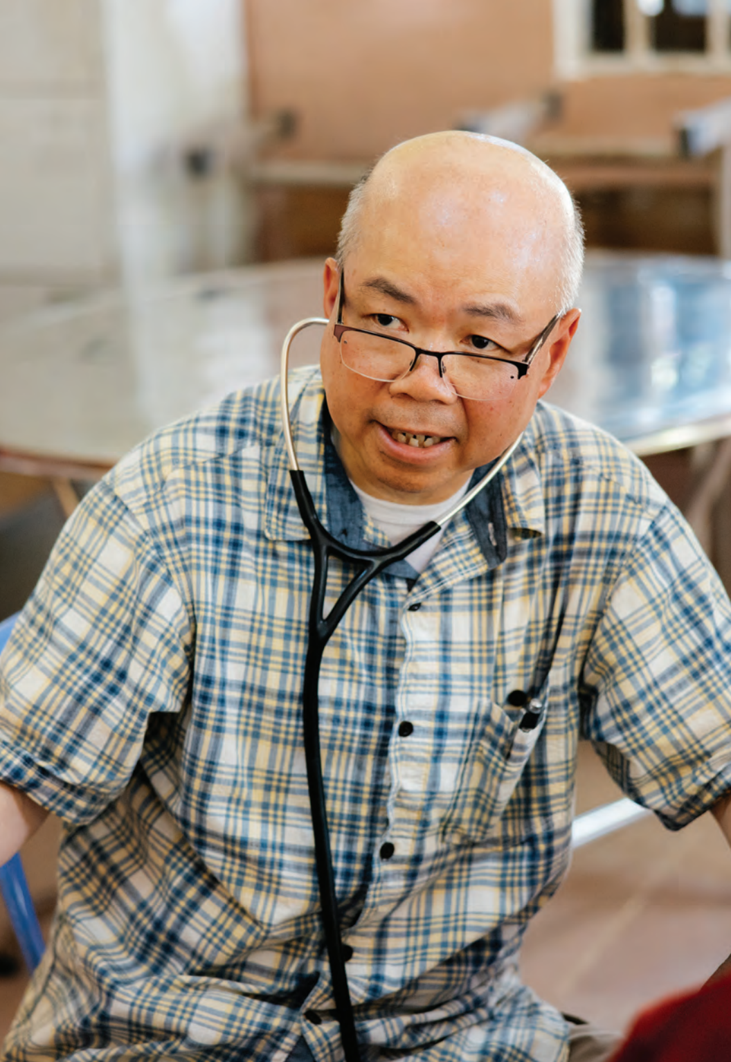
Medical missions in Cambodia